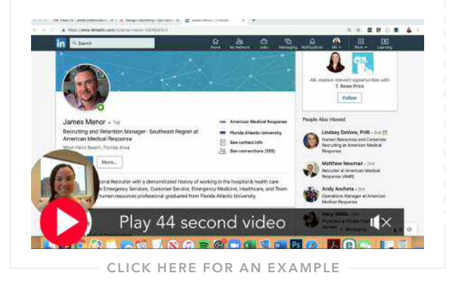
Get Comfortable On Camera | 9

WHY: Not getting the answers you want via email is a frustrating issue that many of us face. Sending a video to check in is a great way to stand out. This is a great opportunity to really personalize your videos to that person to elicit a click. Some of our representatives have used the screen sharing feature and showcased their prospects LinkedIn or website in the first three seconds of their video to create an appealing thumbnail and get results.